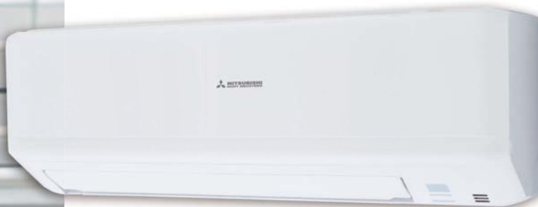
SRK25ZSP-W, SRK35ZSP-W, SRK45ZSP-W